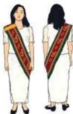
Female, front and back

This is how candidates for graduation should wear the Sablay during the Commencement Exercises, before conferment of their degrees. Note that the Sablay hangs from the right shoulder, with the band slightly below the shoulder.