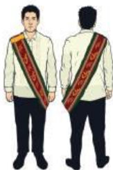
Male, front and back